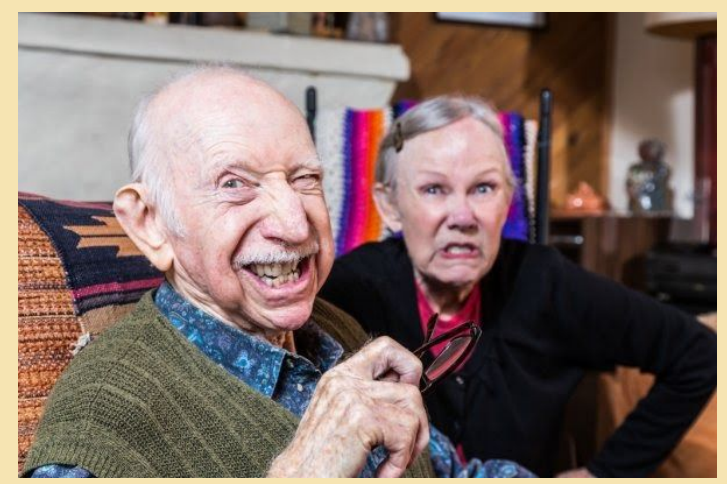
Same couple... still waiting for the Covid vaccine