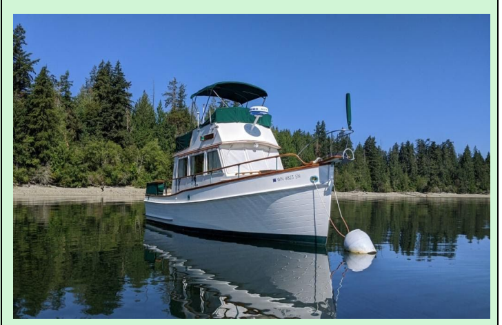
M/V Annalise at Mayo Cove

We hope everyone is well and able to enjoy some boat adventures.