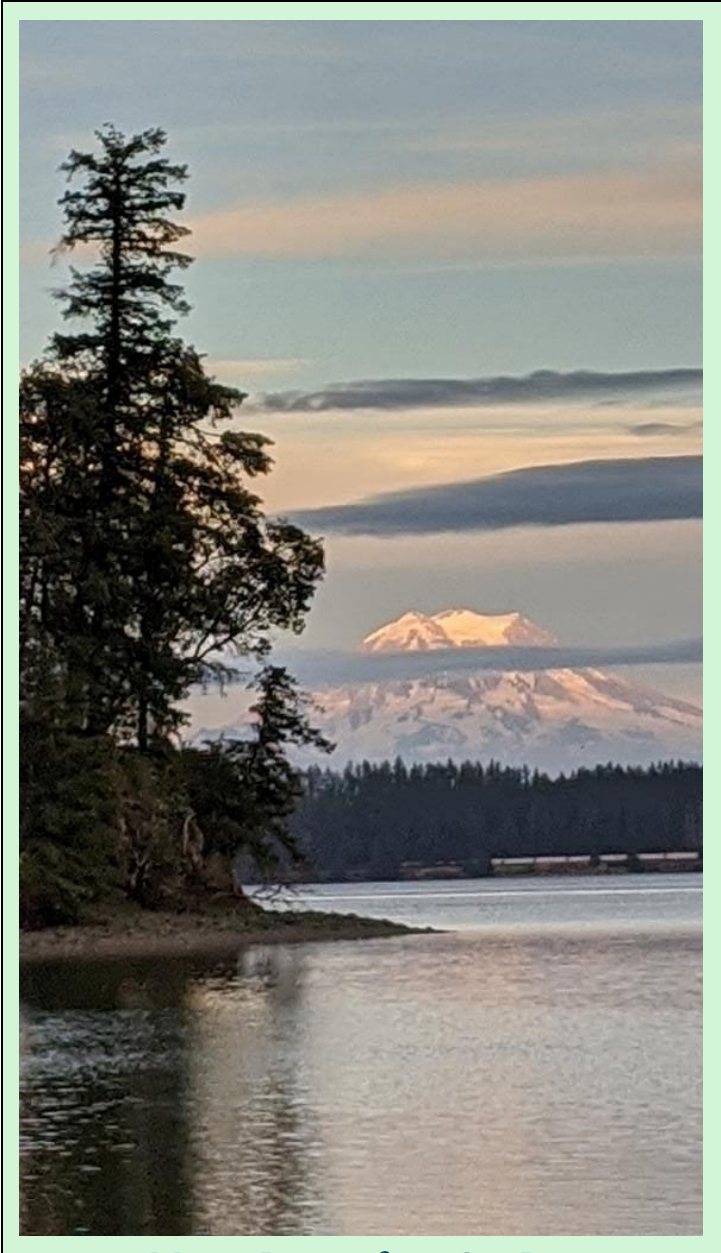
Mount Rainier from Oro Bay